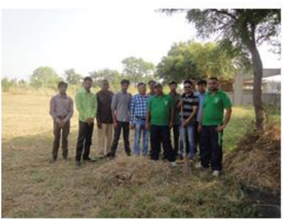
Removal of dry leaves and cut grasses from volleyball court