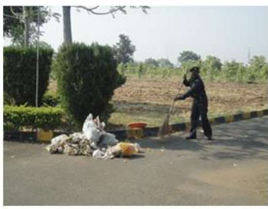
Collection of polythene bags for proper disposal