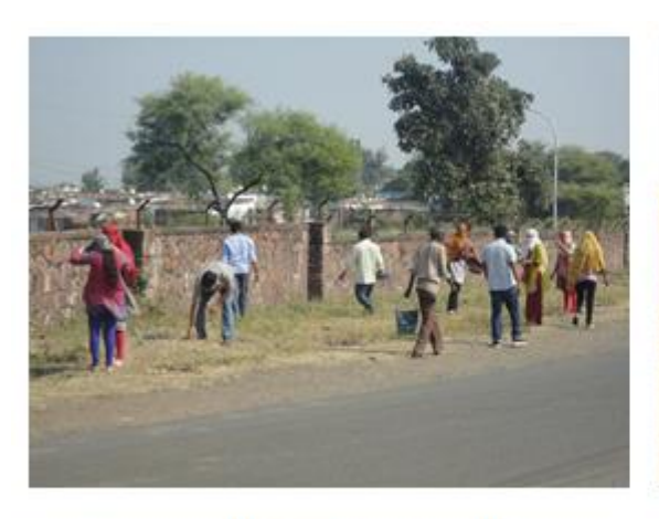
Cleaning outside the boundary wall of residential campus